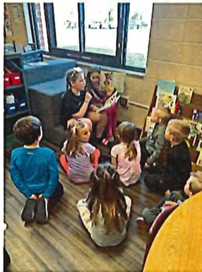
These 4th grade "Reader Leaders" celebrated Dr. Seuss by reading to our Kindergarten friends